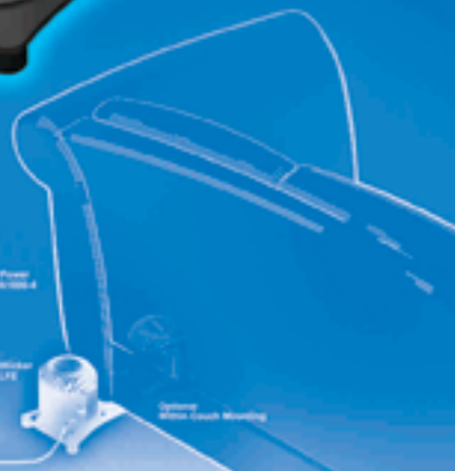
Optional Chair/Couch Mounting

* ButtKicker, amplifier, A/V processor and furniture sold separately.