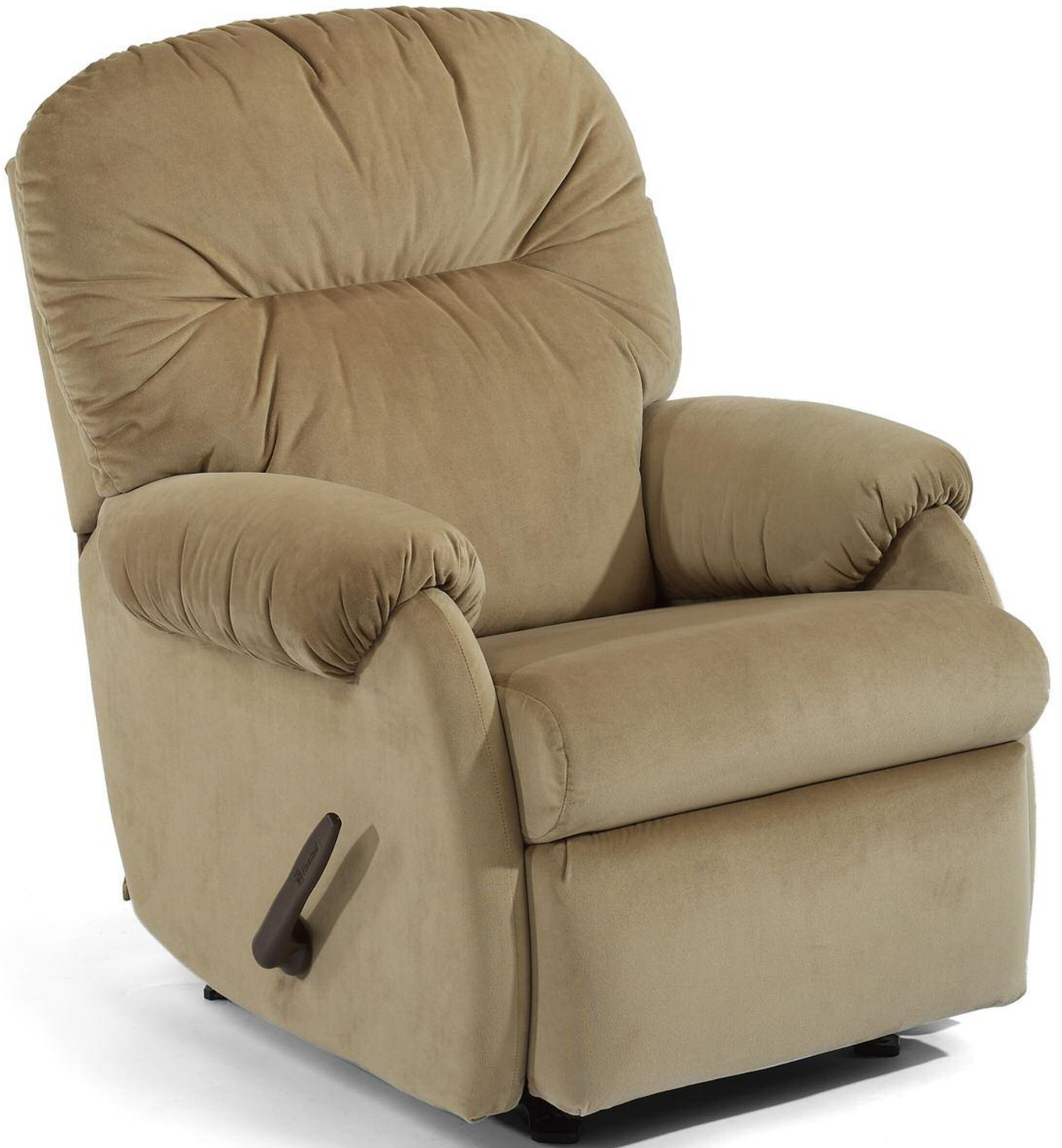
Hawkins 2855 Recliner 38"H x 38"W x 32"D